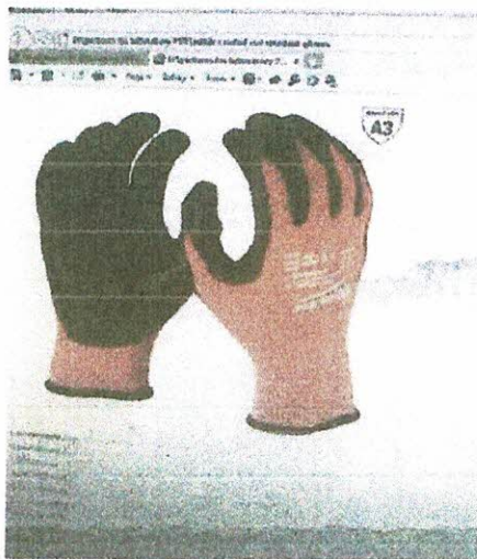
NITRILE-COATED CUT RESISTANT GLOVES