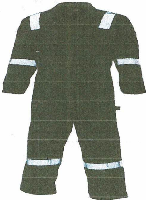
COVER ALL, NAVY BLUE