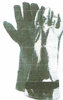
ALUMINIZED RAYON GLOVES